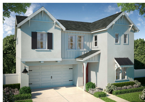
Elevation C - Modern Farmhouse