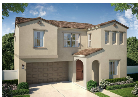
Elevation A - Spanish Revival

This gorgeous Residence One home features approximately 1,975 square feet, 3 bedrooms, 2.5 baths, a study, optional loft or 4th bedroom, and 2-car garage. The gourmet kitchen with a center island includes elegant quartz slab countertops with stainless steel single-basin kitchen sink, choice of White shaker or Contemporary Wenge cabinets throughout, Bertazzoni stainless steel kitchen appliances including 30" range, microwave hood, and dishwasher, storage pantry, comfortable dining area, and expansive great room. The second floor includes a centrally located laundry room with pre-plumbing for a washer and dryer, spacious secondary bedrooms, and a large master suite with adjoining spa-like master bath with dual sinks, oversized shower with hand-laid subway tile walls, and two walk-in closets! This home also comes with luxury vinyl plank flooring throughout the entry, great room and kitchen, 12" x 12" ceramic tile flooring in all baths and laundry, carpet in bedrooms, and much more! Please see Sales Agent for complete details.