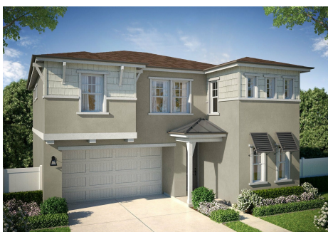
Elevation B - Plantation