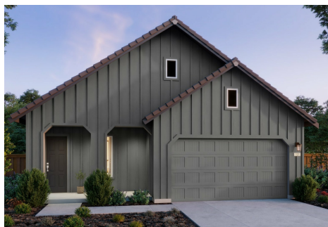
Residence 2A | Modern Farmhouse

1,350 Sq. Ft. 1 Story 2 Bed 2.5 Bath 2 Car Garage