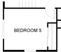
OPTIONAL BEDROOM 5 I/O LOFT