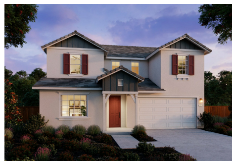
Residence 3C | Modern Farmhouse