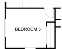
OPTIONAL BEDROOM 5 ILO LOFT