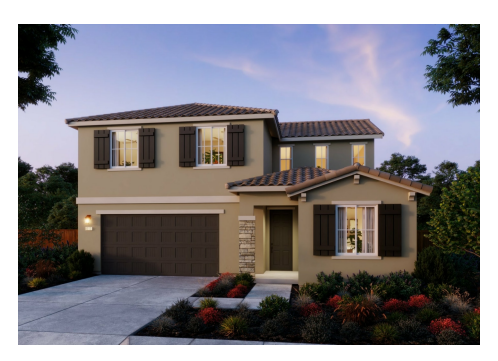
Residence 2A | Tuscan

The Residence 2 Floor Plan is a luxurious modern dwelling in Martinez, CA. This 4-bedroom, 3-bath home spans 2,182 sq. ft. and includes a loft and a 2-car garage. Its open-concept design creates elegant living and entertaining spaces. The master suite offers a personal escape, while the backyard is primed for outdoor gatherings. Experience elevated living in this stylish gem, conveniently situated near amenities and parks. Your ideal home awaits.