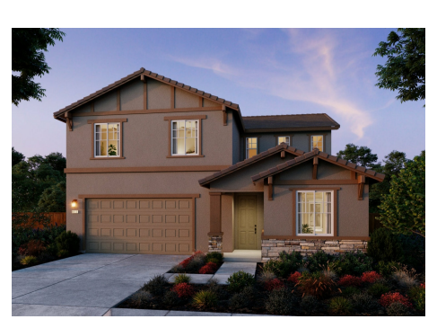
Residence 2B | Craftsman