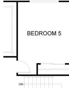
Bed 5 Option

Dayna Floyd | (925) 255-1808 dfloyd@denovahomes.com