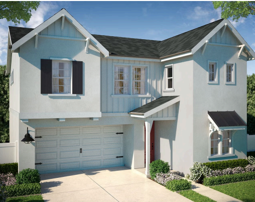
Elevation C - Modern Farmhouse