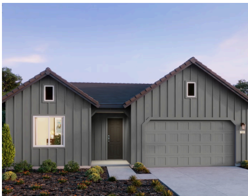
Residence 1A | Modern Farmhouse

The kitchen is a true centerpiece, adorned with elegant Quartz countertops paired with a 6-inch backsplash, and