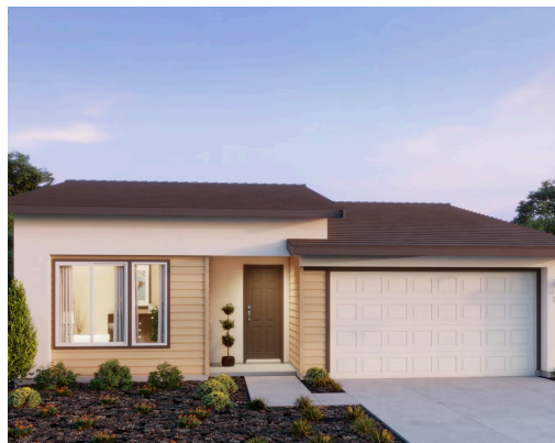
Residence 1B | Midcentury Modern Ranch

All renderings are artist's conception. Actual porch and window configuration varies from artists renderings. DeNova Homes reserves the right to make changes in price, material, and specifications without notice and without liability for such changes. Broker cooperation welcome. Sales & marketing by DeNova Homes Sales, DRE #01247582 Equal Housing Opportunity.