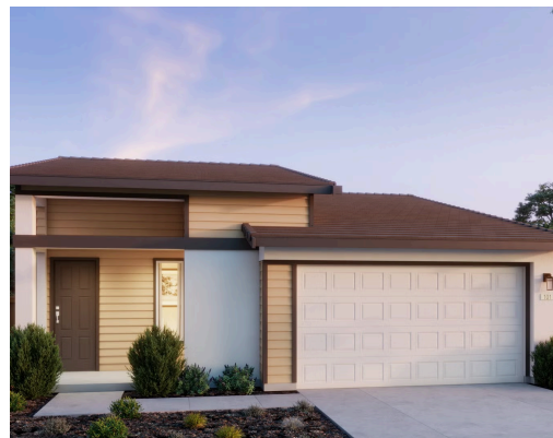
Residence 2B | Mid Century Modern Ranch

All renderings are artist's conception. Actual porch and window configuration varies from artists renderings. DeNova Homes reserves the right to make changes in price, material, and specifications without notice and without liability for such changes. Broker cooperation welcome. Sales & marketing by DeNova Homes Sales, DRE #01247582 Equal Housing Opportunity.