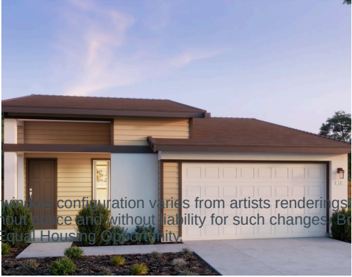
Residence 2B | Mid Century Modern Ranch House

All renderings are artist's conception. Actual color and window configuration varies from artists renderings. DeNova Homes reserves the right to make changes in price, material, and specifications without notice and without liability for such changes. Broker cooperation welcome. Sales & marketing by DeNova Homes Sales, DRE #01247682 Equal Housing Opportunity.