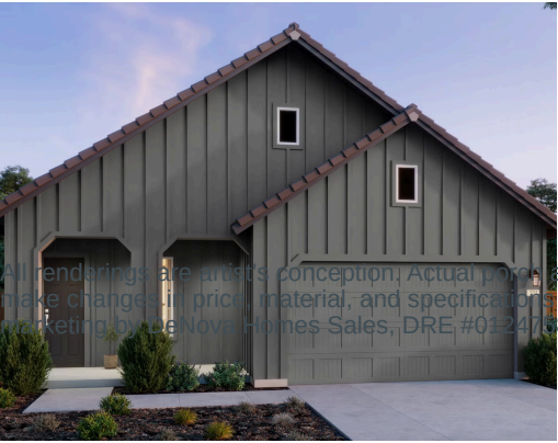
Residence 2A | Modern Farmhouse