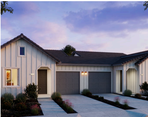
Residence 1A | Modern Farmhouse