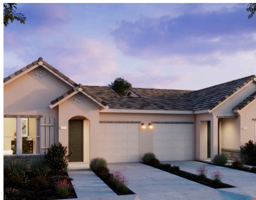
Residence 1A | Modern Farmhouse