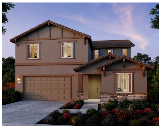
Residence 1B | Craftsman