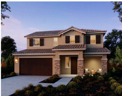
Residence 1A | Tuscan

Upstairs, the private owner's suite is a true retreat, complete with a spa-inspired bathroom and a walk-in closet. Two secondary bedrooms, a full bathroom, and a conveniently located laundry room provide comfort and functionality for the