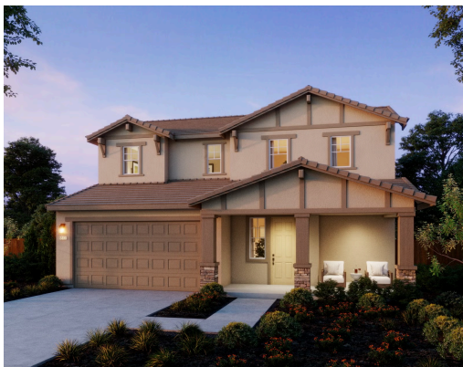
Residence 1B | Craftsman