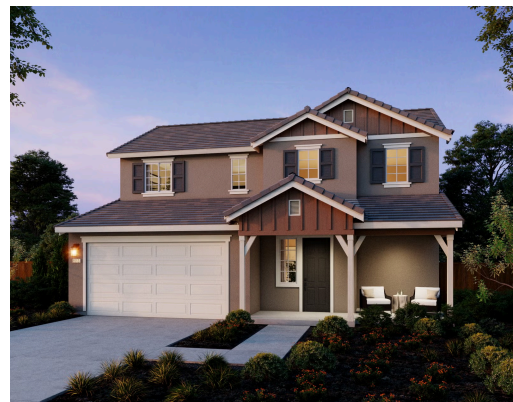
Residence 1C | Modern Farmhouse