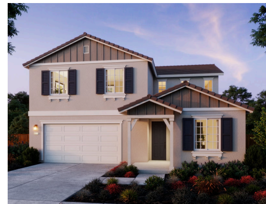
Residence 2C | Modern Farmhouse

All renderings are artist's conception. Actual porch and window configuration varies from artists renderings. DeNova Homes reserves the right to make changes in price, material, and specifications without notice and without liability for such changes. Broker cooperation welcome. Sales & marketing by DeNova Homes Sales, DRE #01247582 Equal Housing Opportunity.