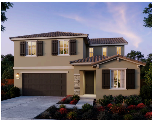
Residence 2A | Tuscan

Upstairs, a spacious loft offers a comfortable spot for relaxation, entertainment, or a home office, with the option to convert it