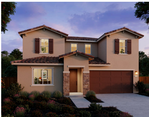
Residence 3A | Tuscan

The second floor offers a balance of flexibility and privacy, starting with a bright and open loft that can be tailored to your