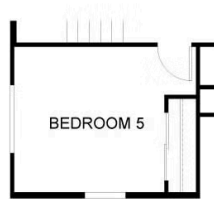
OPTIONAL BEDROOM 5 ILO LOFT