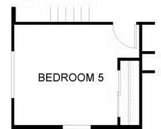
OPTIONAL BEDROOM 5 ILO LOFT