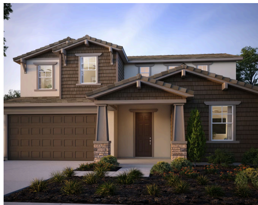
Residence 3 | Craftsman Elevation