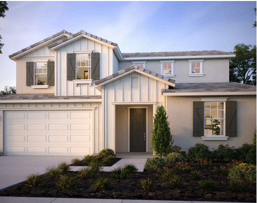
Residence 3 | Farmhouse Elevation