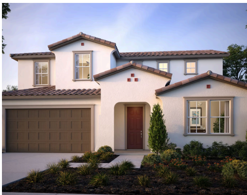
Residence 3 | Spanish Elevation

Gorgeous two-story in to Martinez! This home features 2,813 Sq. Ft. (approx.) of living space, 4 bedrooms, 3 baths, and a 2-car garage! The first floor features a bedroom and full bath, perfect for a guest or older relative. The expansive Great Room has plenty of room to entertain friends and family, a large Family Dining area, and a gourmet Kitchen. The second floor includes a Loft, a centrally located Laundry Room with pre-plumbing for a washer and dryer, spacious secondary bedrooms, a large Owner's Suite with a walk-in closet, and an adjoining private bath with dual vanities. Please see the Sales Agent for complete details.