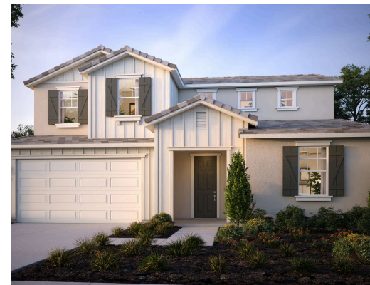
Residence 3 | Farmhouse Elevation