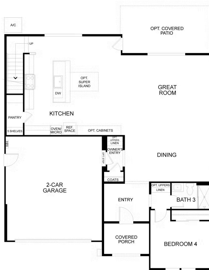
Residence 3 First Floor