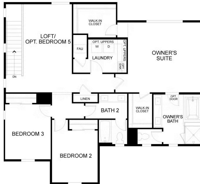
Residence 3 Second Floor