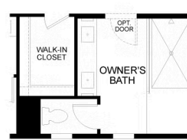
OPTIONAL SUPER SHOWER