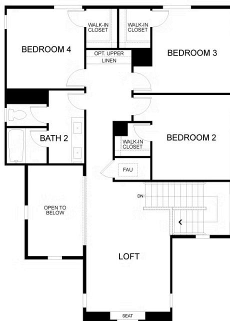
Residence 4 Second Floor