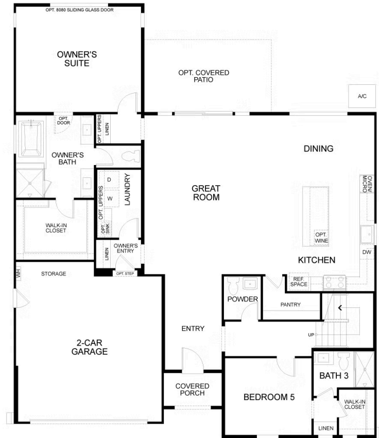
Residence 4 First Floor