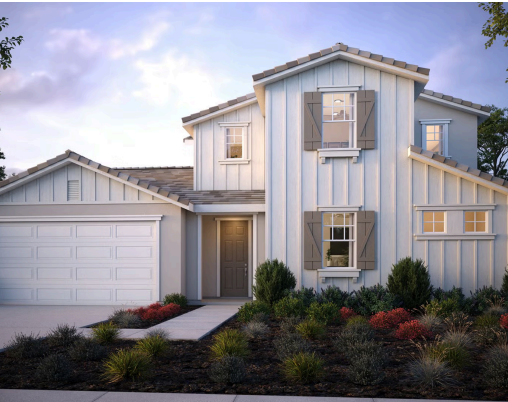
Residence 4 | Farmhouse Elevation