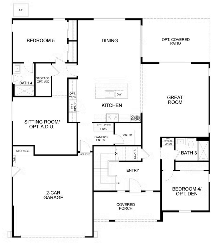
Residence 5 First Floor