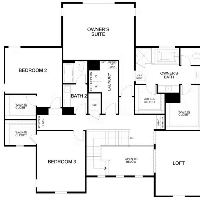
Residence 5 Second Floor