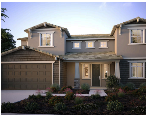
Residence 5| Craftsman Elevation