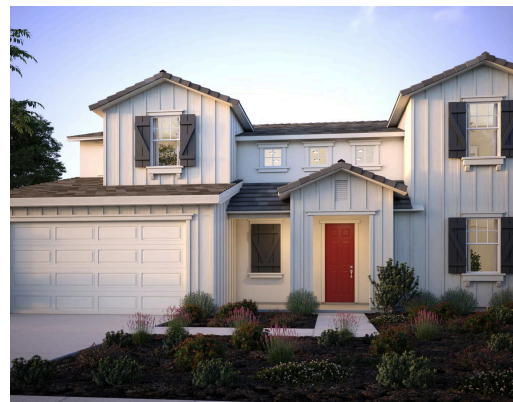
Residence 5| Farmhouse Elevation