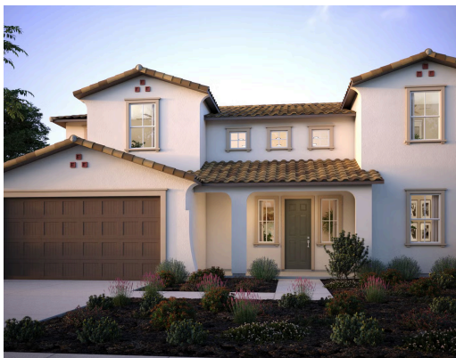
Residence 5| Spanish Elevation

Stunning two-story home in Martinez! This home boasts 3,578 Sq. Ft. (approx.) of living space, 5 bedrooms, 4 baths, and a 2-car garage! The first floor features two secondary bedrooms with full baths, and the option to turn one of the rooms into an ADU! The expansive Great Room has plenty of room to entertain friends and family, a large Family Dining area, and a gourmet Kitchen. The second floor includes a Loft, a centrally located Laundry Room with pre-plumbing for a washer and dryer, spacious secondary bedrooms, a large Owner's Suite with two walk-in closets, and an adjoining private bath with dual split vanities. Please see the Sales Agent for complete details.