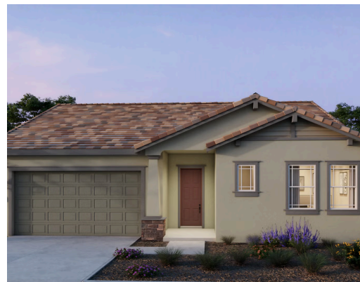
Residence 11D | Traditional

All renderings are artist's conception. Actual porch and window configuration varies from artists renderings. DeNova Homes reserves the right to make changes in price, material, and specifications without notice and without liability for such changes. Broker cooperation welcome. Sales & marketing by DeNova Homes Sales, DRE #01247582 Equal Housing Opportunity.