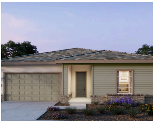
Residence 11C | Prairie