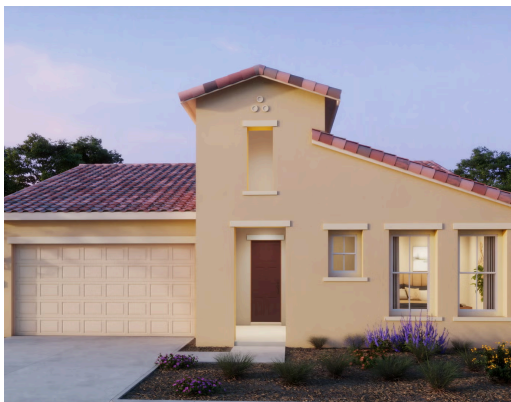
Residence 11A | Spanish

The owner's suite is privately located towards the back of the home and features a generous walk-in closet and spa inspired bathroom. A covered patio extends the living space outdoors, ideal for weekend barbecues or quiet evenings. With three distinct elevations to choose from, Residence 11 combines smart design with timeless curb appeal.