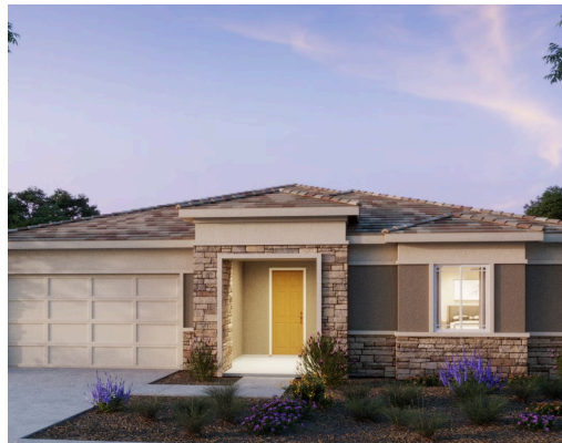
Residence 15C | Prairie