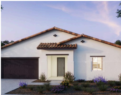
Residence 15A | Spanish

An expansive owner's suite offers a spa-like bath and a spacious walk-in closet for the perfect retreat at the end of the day. A covered front porch sets the tone for the home's welcoming character, while the included outdoor living area expands your space for relaxation and entertaining. A large laundry room with built-in upper cabinets adds everyday convenience. See