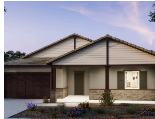
Residence 15D | Traditional

All renderings are artist's conception. Actual porch and window configuration varies from artists renderings. DeNova Homes reserves the right to make changes in price, material, and specifications without notice and without liability for such changes. Broker cooperation welcome. Sales & marketing by DeNova Homes Sales, DRE #01247582 Equal Housing Opportunity.