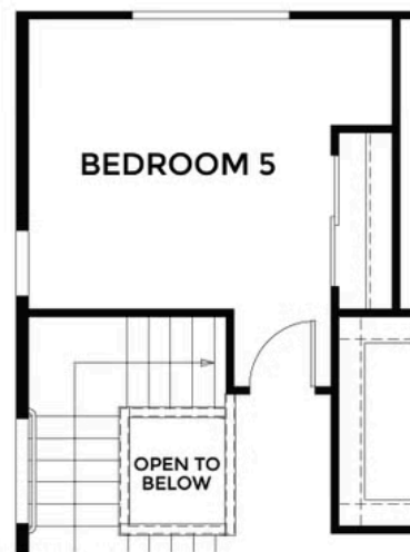
OPTIONAL BEDROOM 5 ILO LOFT