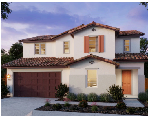
Residence 10A | Spanish

The first floor boasts a gourmet kitchen with an island, seamlessly connected to a dedicated dining area and a bright, inviting Great Room, creating the perfect hub for family gatherings and celebrations. Additionally, a full bedroom with an ensuite bathroom on the main level makes an ideal guest suite or space for extended family members. Adjacent to both the dining