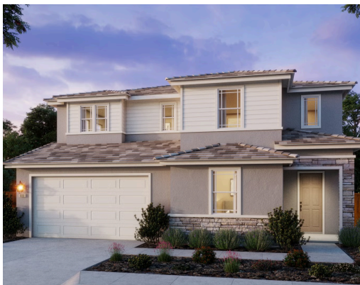
Residence 10C | Prairie