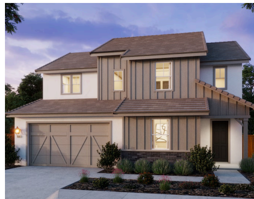
Residence 10E | Farmhouse