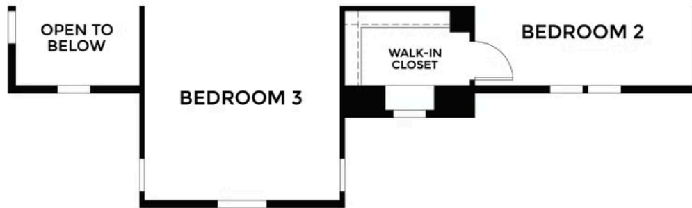
ELEVATION FARMHOUSE SECOND FLOOR (SAME AS SPANISH)