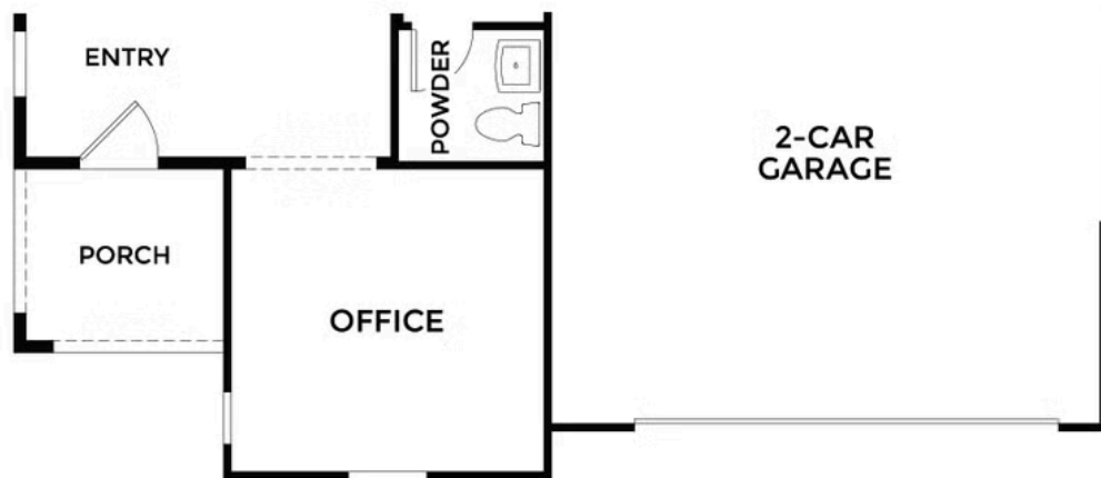
ELEVATION PRAIRIE FIRST FLOOR (SAME AS SPANISH)