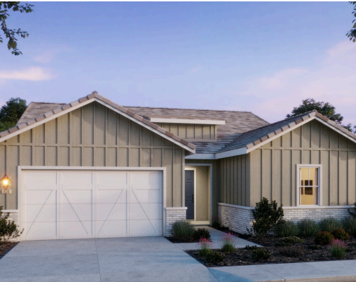
Residence 8E | Farmhouse

DeNova Homes reserves the right to make changes in price, material, and specifications without notice and without liability for such changes. Broker cooperation welcome. Sales & marketing by DeNova Homes Sales, DRE #01247582 Equal Housing Opportunity.