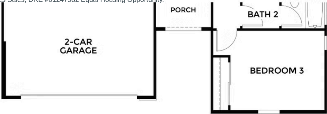
ELEVATION FARMHOUSE FIRST FLOOR