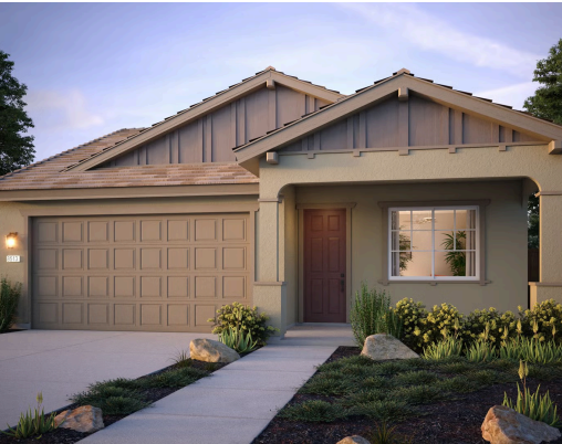
Residence 1 | Craftsman Bungalow