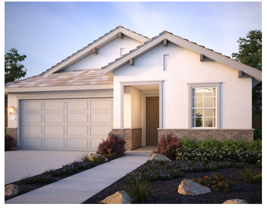
Residence 2 | Bay Area Bungalow