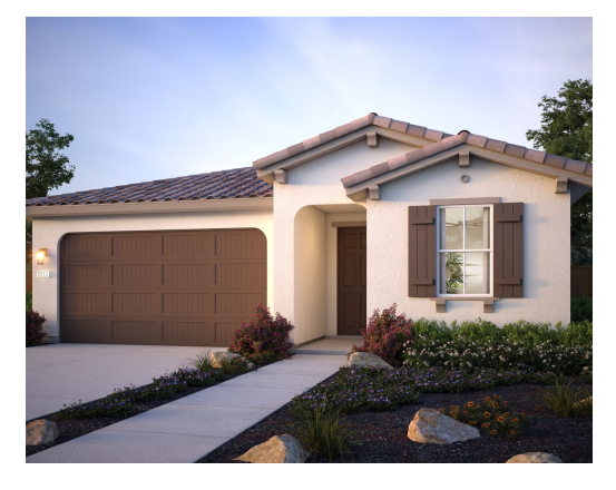
Residence 2 | Spanish Bungalow