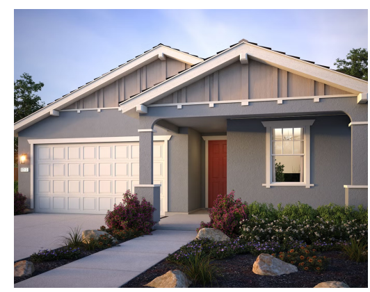
Residence 2 | Craftsman Bungalow