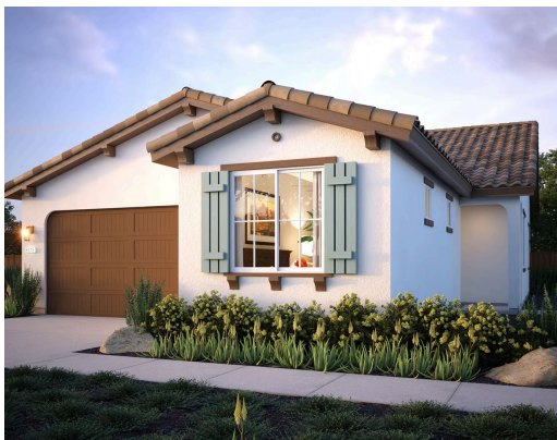
Residence 3 | Spanish Bungalow