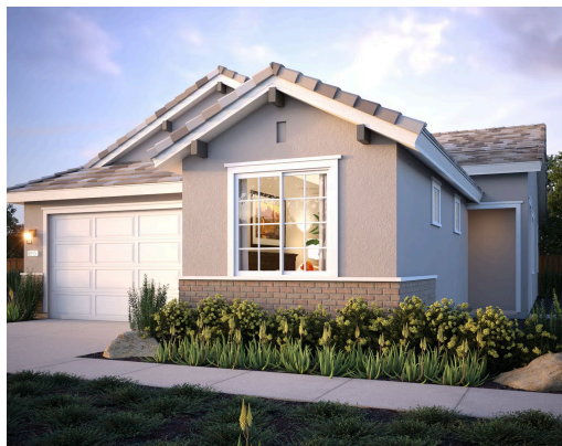
Residence 3 | Bay Area Bungalow