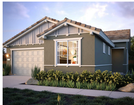
Residence 3 | Craftsman Bungalow

All renderings are artist's conception. Actual porch and window configuration varies from artists renderings. DeNova Homes reserves the right to make changes in price, material, and specifications without notice and without liability for such changes. Broker cooperation welcome. Sales & marketing by DeNova Homes Sales, DRE #01247582 Equal Housing Opportunity.