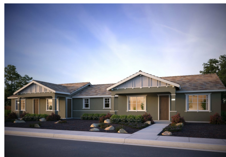
Residence 5 (Duet) | Craftsman Bungalow

All renderings are artist's conception. Actual porch and window configuration varies from artists renderings. DeNova Homes reserves the right to make changes in price, material, and specifications without notice and without liability for such changes. Broker cooperation welcome. Sales & marketing by DeNova Homes Sales, DRE #01247582 Equal Housing Opportunity.