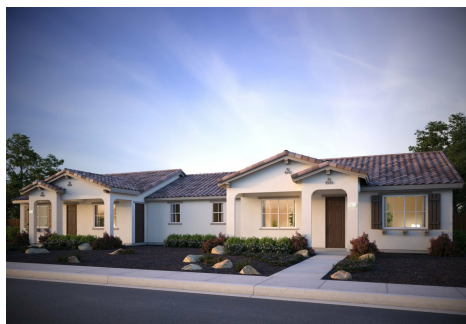
Residence 5 (Duet) | Spanish Bungalow

Low-maintenance single-level duet (duplex) home in Rio Vista's newest 55+ Active Adult Community! 1,160 Sq. Ft. (approx.) of living space, 2 bedrooms, 2 baths, and a 1-car garage! This charming floor plan has a spacious kitchen with an island overlooking the Dining area, an expansive Great Room, and a covered porch. This home also includes a private owner's suite with an adjoining private bath, a walk-in closet, and so much more! Please see the Sales Agent for complete details.