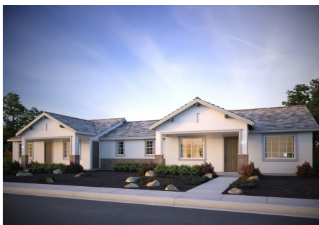
Residence 5 (Duet) | Bay Area Bungalow