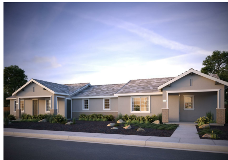
Bay Area Bungalow