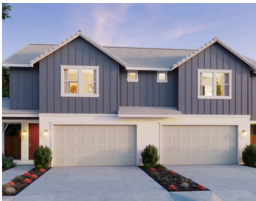
Residence 2A | Farmhouse

Elegance meets practicality in the Residence 2 duet floorplan. This home is tailored for those who appreciate a thoughtful layout and contemporary finishes creating a comfortable and inviting living experience. Residence 2 presents a beautifully designed duet offering 1,588 square feet of comfortable living space. This 3-bedroom, 2.5 bath home features a spacious great room that effortlessly blends the living, dining, and kitchen areas, creating the perfect space for entertaining or everyday gatherings. The primary suite offers a peaceful retreat with an en-suite bathroom and a spacious walk-in closet. Two additional bedrooms share a full bathroom, providing ample space for family or guests. The attached two-car garage adds extra convenience and storage options. Residence 2 combines modern design with functional living, making it the ideal