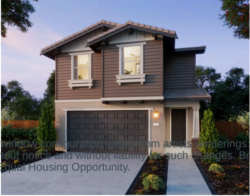
Residence 3B | Craftsman

All renderings are artist's conception. Actual porch and window configuration varies from artists renderings. DeNova Homes reserves the right to make changes in price, material and specifications without notice and without liability for such changes. Broker cooperation welcome. Sales & marketing by DeNova Homes Sales, DRE #01247582 Equal Housing Opportunity.