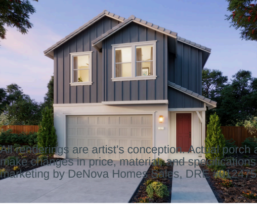
Residence 3A | Farmhouse